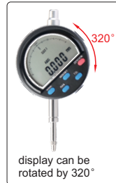
display can be rotated by 320°