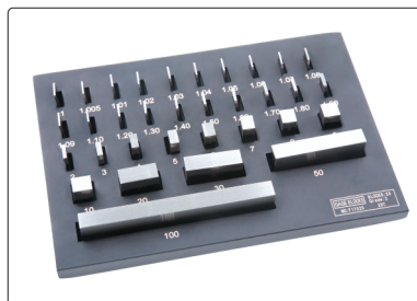
Gage block set (grade 2,ISO3650) for 256-160-11