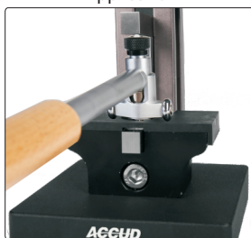
Gage block set for 256-160-11