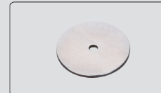
Standard block (included)