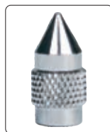
point push tip