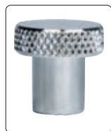
flat push tip