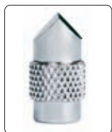
knife-edge push tip