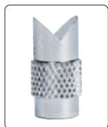
V type push tip