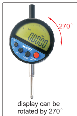
display can be rotated by 270°